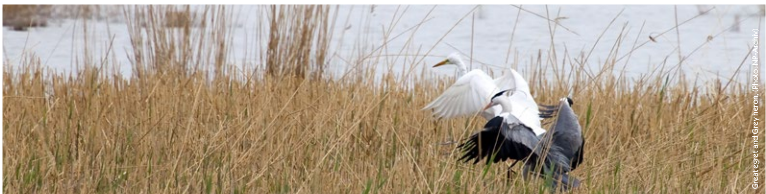
Great egret and Grey heron, (Photo: NP-Archiv)