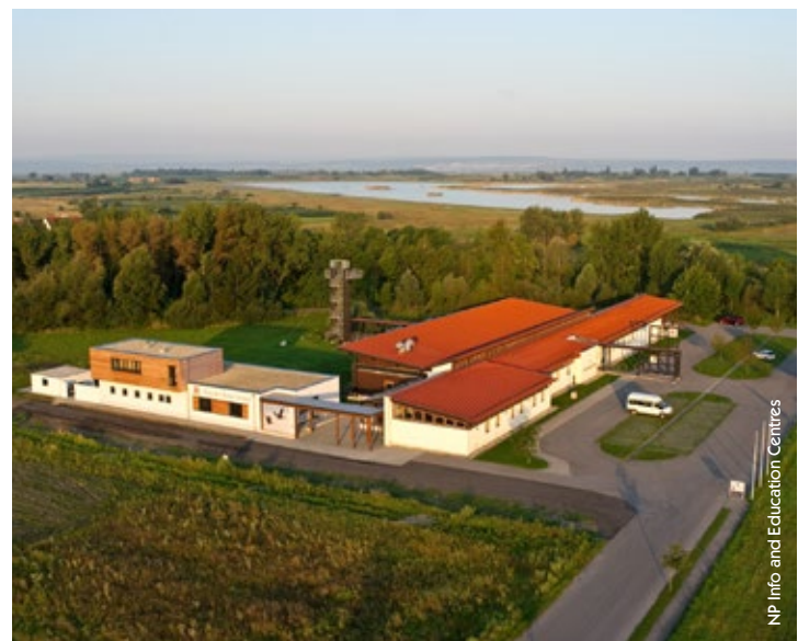
NP Info and Education Centres