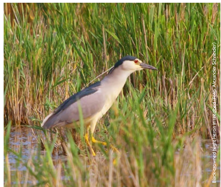
Black-crowned Night Heron in Reedbed