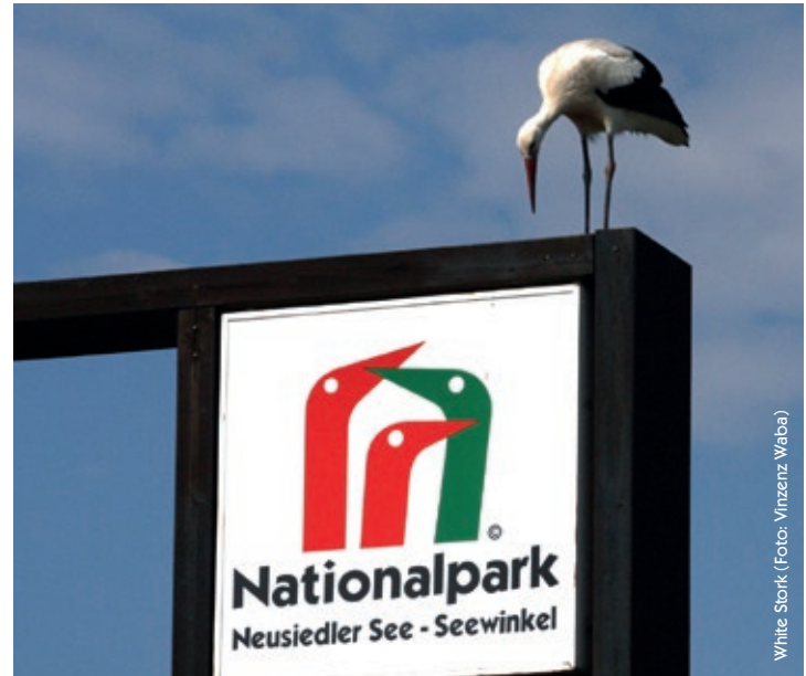
White Stork

What makes the Neusiedler See natural region so attractive to the international birding fraternity is therefore not just the opportunity to watch and photograph rare bird species at all times of the year, but its proximity to similar or, in species terms, quite different ecosystems. And for this reason the National Parks, nature parks and the active nature conservation organisations of the region are important partners of the Neusiedler See-Seewinkel National Park in the design of the Bird Experience programme of events and in practical nature conservation in general.