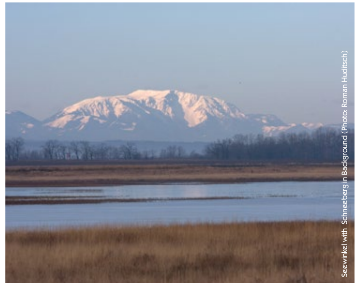
Seewinkel with Schneeberg in background

the BEX programme of events for children