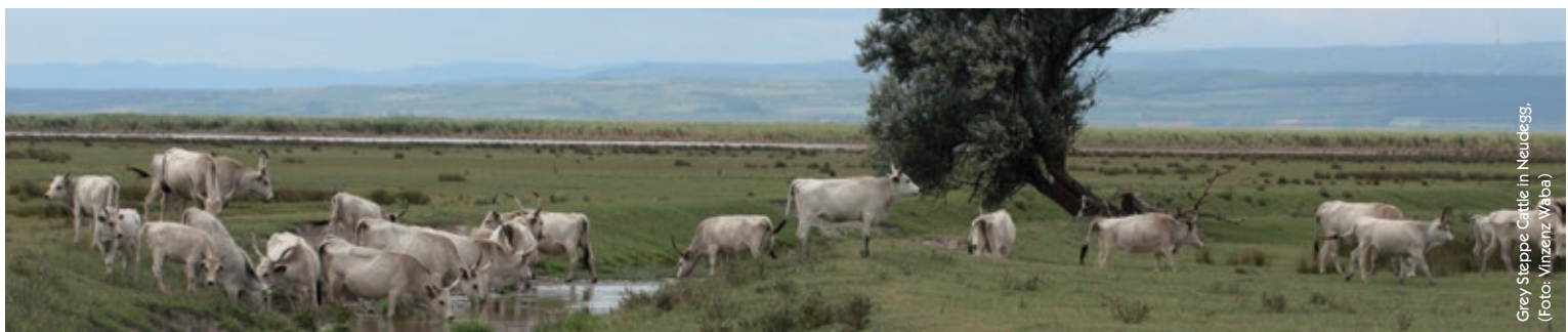
Grey Steppe Cattle in Neuckcs, (Foto: Vinzenz Waba)

www.birdexperience.org · e.lauber@birdexperience.org